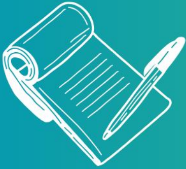
Notepad & pen