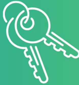
Spare keys & access codes