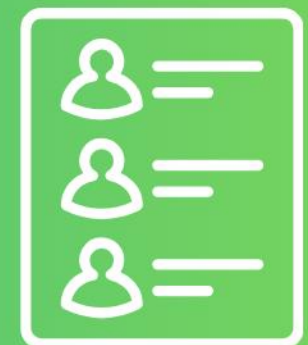
Emergency Contact List

This is a suggested list. Please consider the needs of all staff and residents